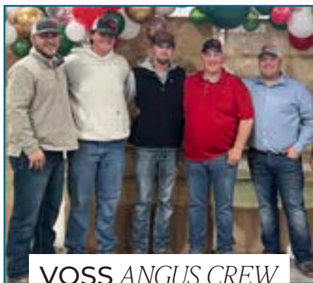
VOSS ANGUS CREW

they added a waterproofing business and over time a concrete pumping business. Those businesses are very integral to their foundation business to this day.